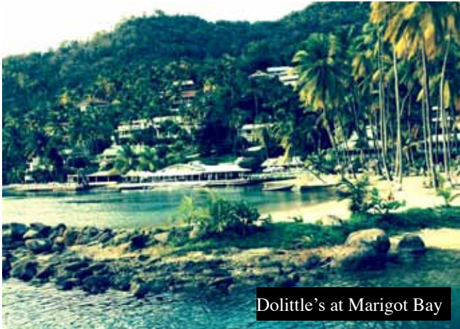
Dolittle's at Marigot Bay