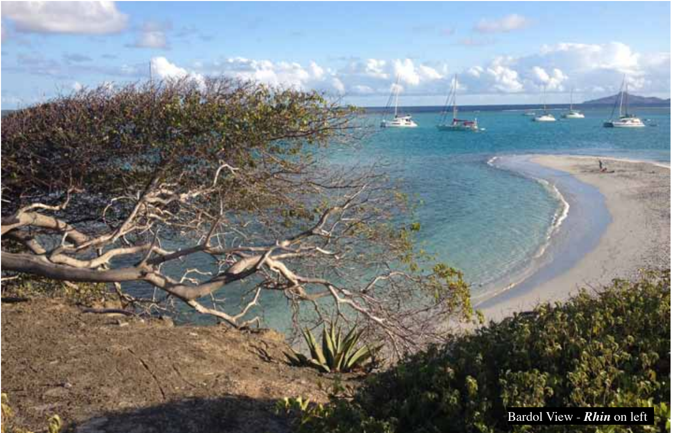
Bardol View - Rhin on left