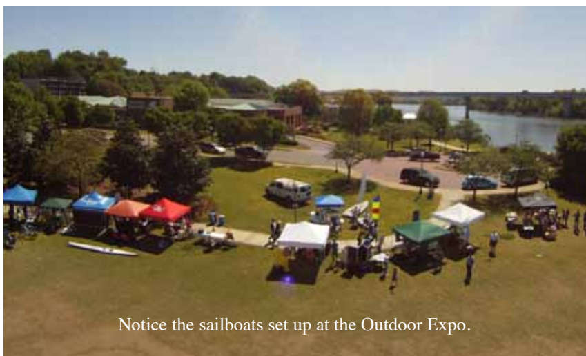
Notice the sailboats set up at the Outdoor Expo.

RC's be sure to fully identify boats & skippers when recording race results. List name of skipper, type of boat and sail number for each boat.