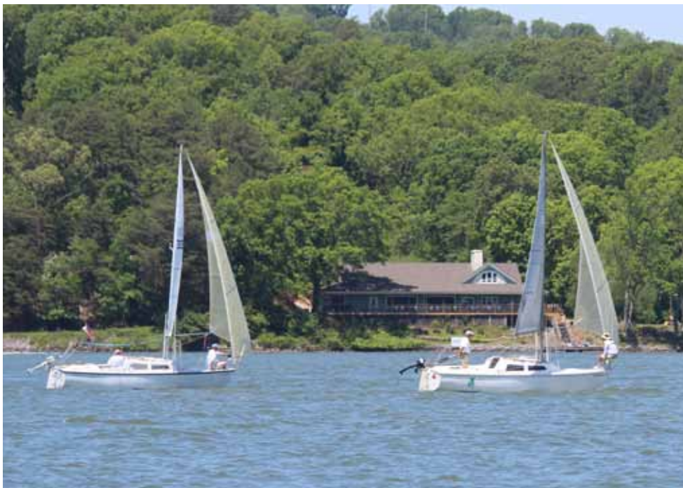
Catalina 22 Chattanooga Challenge boats pass by the new PYC Clubhouse - photo by Jim Davis, above - more pictures on pages 4-5

was organized on July 25, 1940, in order to promote sailing in the Chickamauga Lake area and particularly in Chattanooga; to teach its members to talk the language of the sea and build up a marine tradition for "The Great Lakes of The South;" to help promote water safety and a code of ethics for the waterways; to form a social and activity nucleus for people in the area interested in sailing; and to develop an active relationship with other sailing and boating organizations to promote racing and other boating activities.