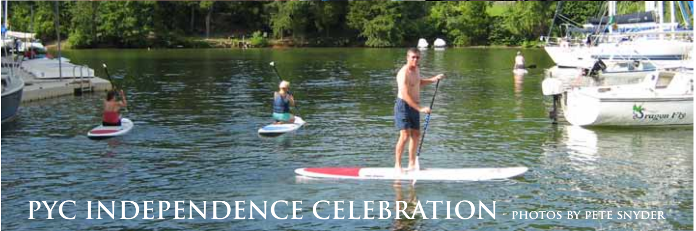
PYC INDEPENDENCE CELEBRATION