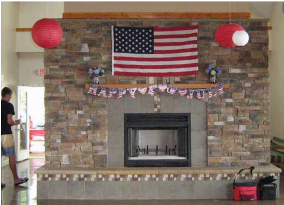
New Clubhouse Fireplace - see more photos on pages 4-6

was organized on July 25, 1940, in order to promote sailing in the Chickamauga Lake area and particularly in Chattanooga; to teach its members to talk the language of the sea and build up a marine tradition for "The Great Lakes of The South;" to help promote water safety and a code of ethics for the waterways; to form a social and activity nucleus for people in the area interested in sailing; and to develop an active relationship with other sailing and boating organizations to promote racing and other boating activities.