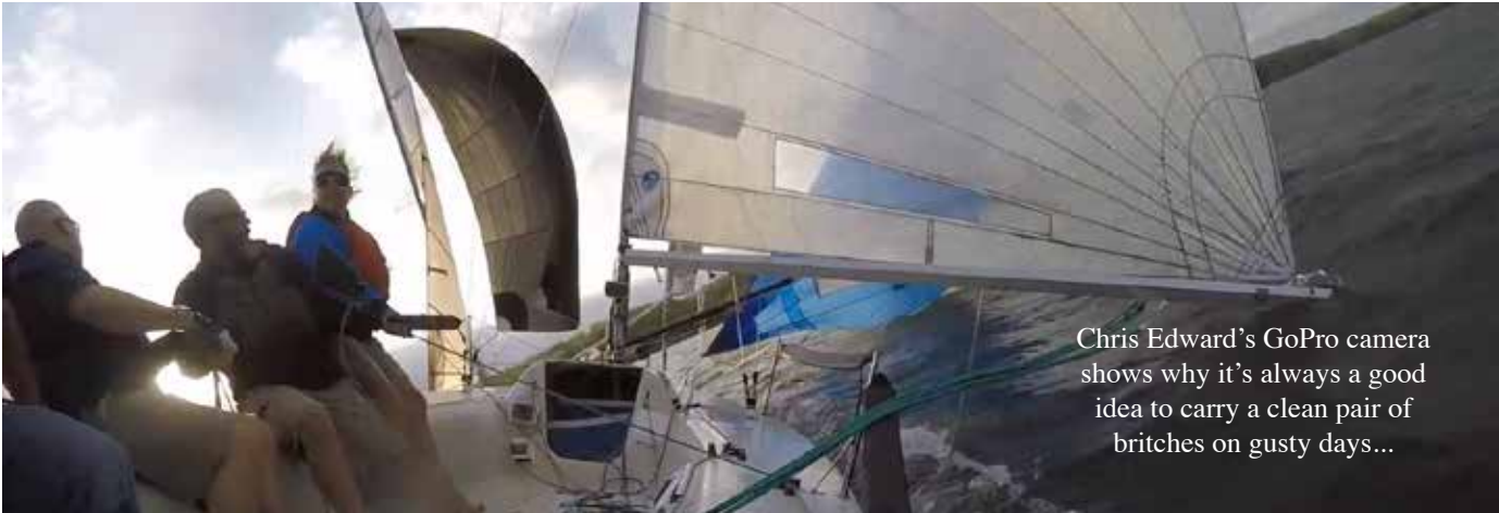
Chris Edward's GoPro camera shows why it's always a good idea to carry a clean pair of britches on gusty days...